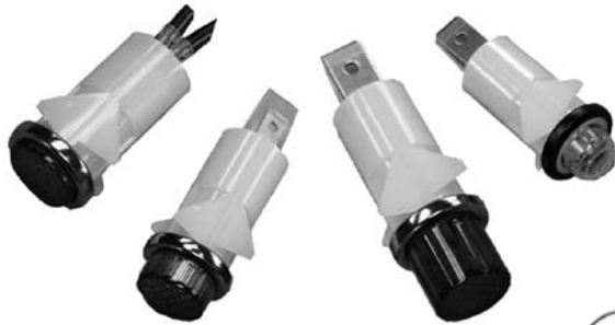
Shown with lens 38